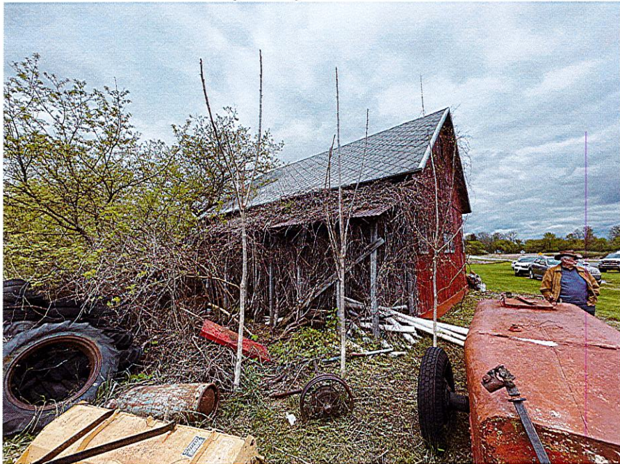
SOUTH SIDE LEAN-TO FOR CORN CRIB