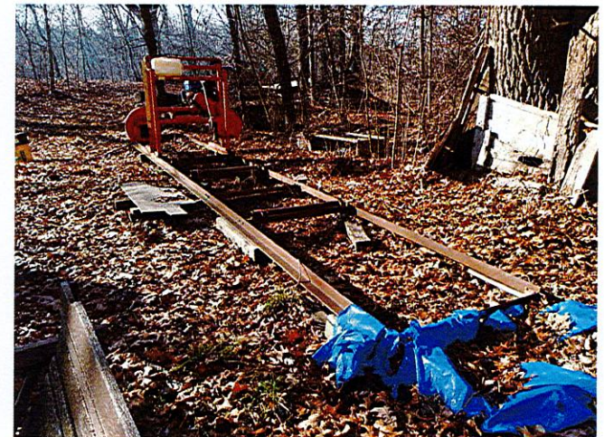
Example of a portable sawmill.