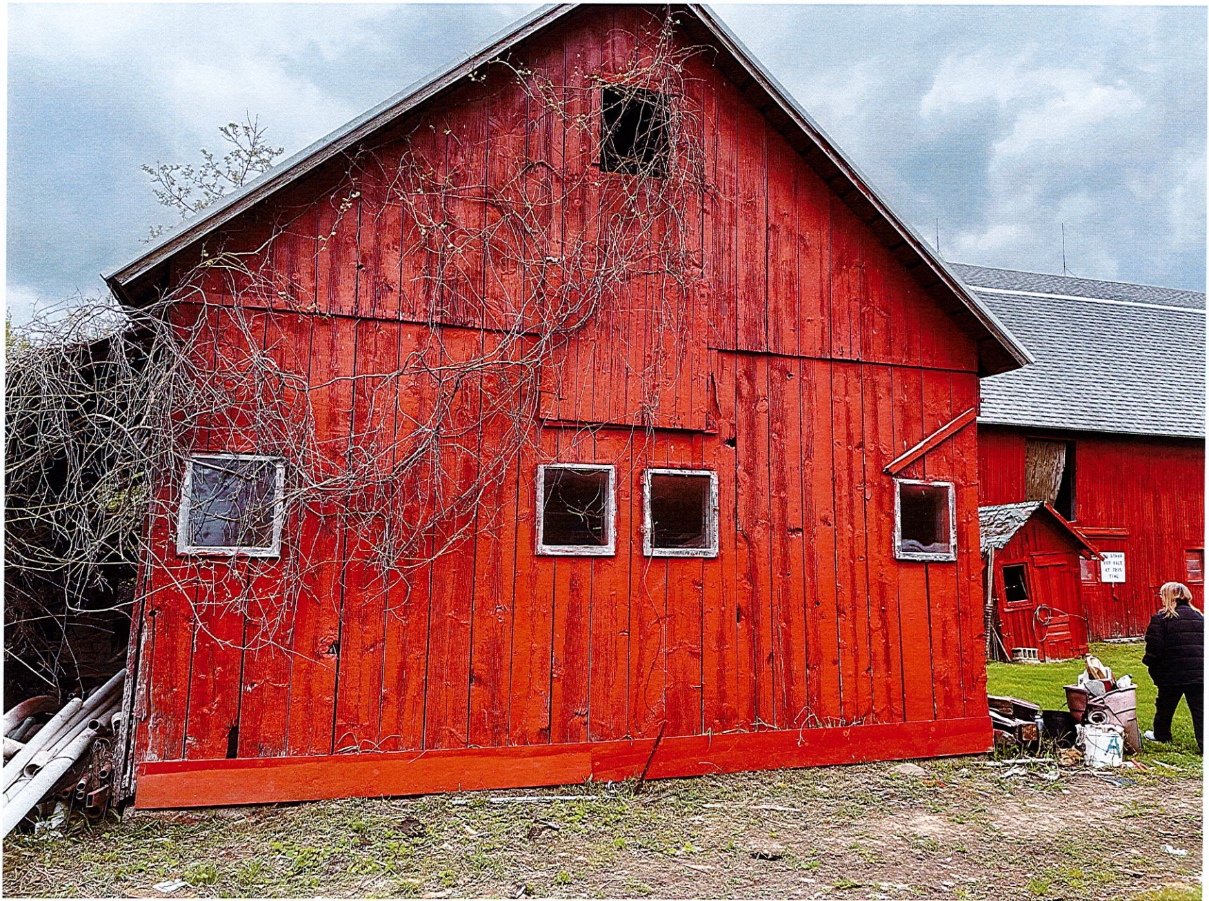
EAST SIDE OF ROPER BARN