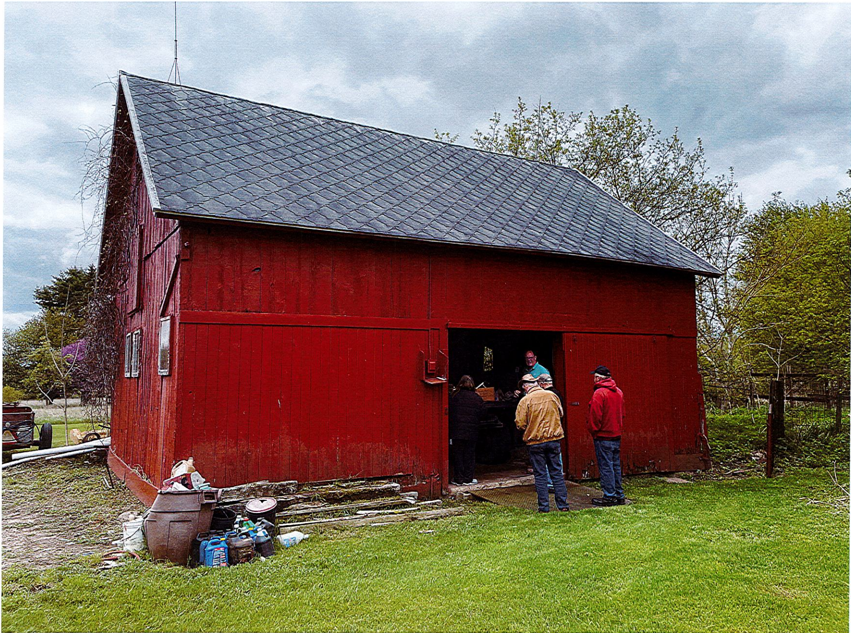
NORTH SIDE OF ROPER BARN